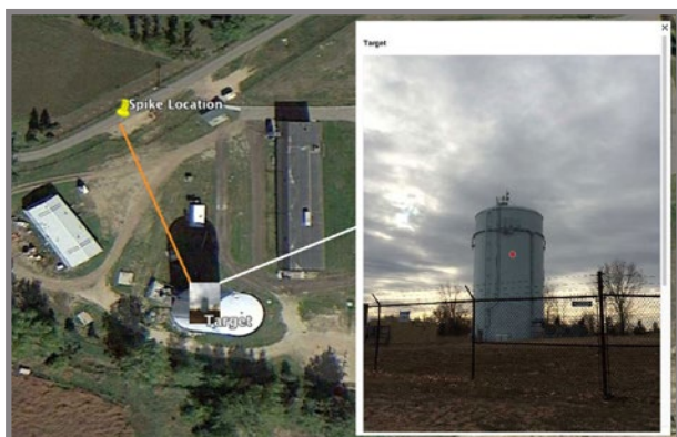
Capture a target's location, your location and a georeferenced image of the target

Once on-site, capture a photo of an object, such as a building, using your smartphone or tablet and Spike. Then, draw measurements on the photo, such as area, height, width, and length using the Spike mobile app or the Spike Cloud. These measurements can be used to determine building heights, and dimensions of windows and doors for urban tactical operations.