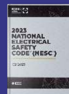
2023 NESC Codebook