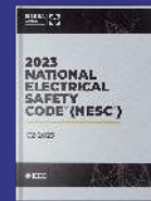
2023 NESC Codebook