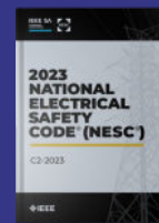
2023 NESC Codebook